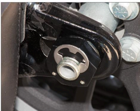
7 After the new axle nut was tightened, to 90 ft.-lbs., we installed the factory snap ring.