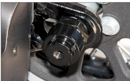
8 The Roto-Plate adaptor is secured with four Allen screws.