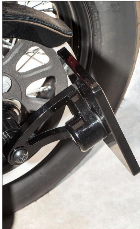
9 The Rotor-Plate mount is then attached with the included Allen bolt, which was torqued to 56 ft.-lbs.