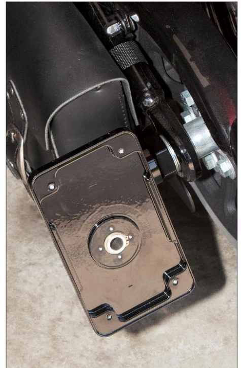
10 The center shaft of the Roto-Plate's hub is hollow for the license frame's wiring to run through. We spliced the license light's wires to the Slim's taillight wires.