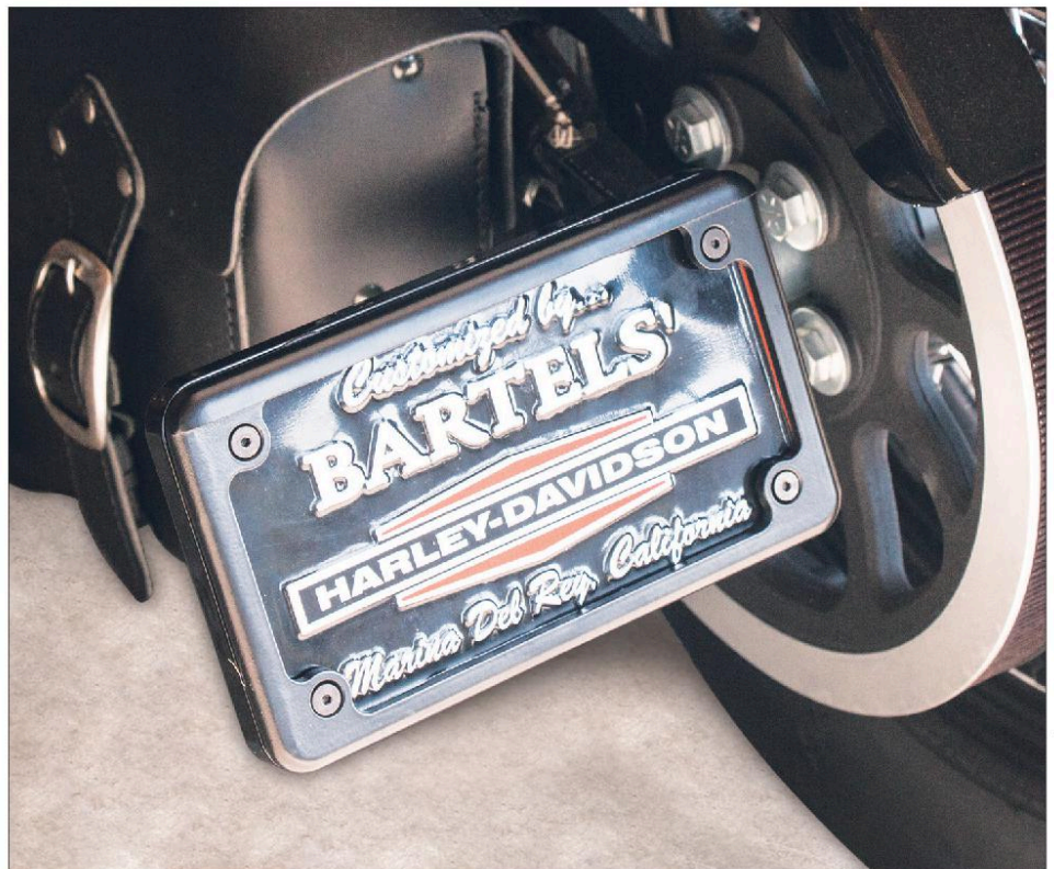
11 The Roto-Plate with the license in its horizontal orientation.