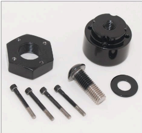
5 The kit's axle nut and bracket mounting adaptor, not powdercoating the mounting screws threads shows that the guys at Top Down have thought the assembly process through.