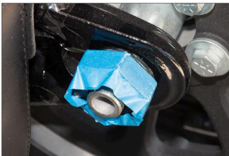
6 To keep from scratching the axle nut, we wrapped it with masking tape.