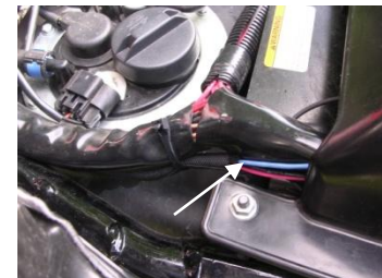
Route and connect to Factory Harness