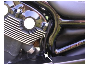
Factory wire loop